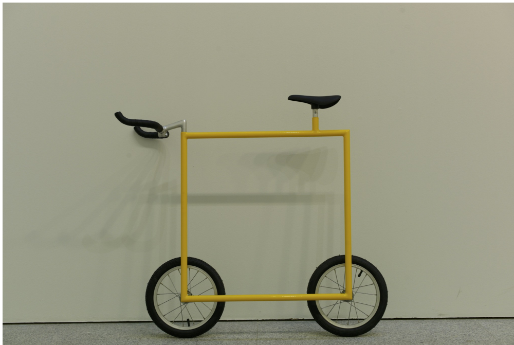
A classroom for error – Nicolás Paris (1977)