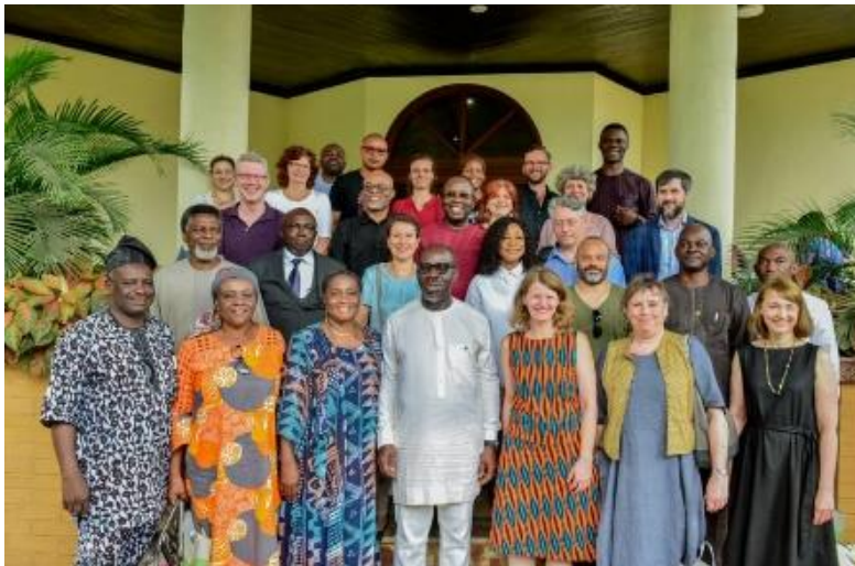
Benin Dialogue Group meeting in Benin City, Edo State, 9 July 2019