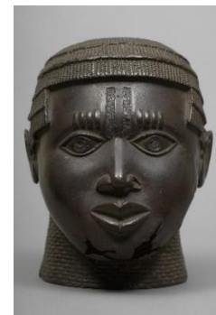
Commemorative Head 15th-16th century

Hamburg, April 16, 2020 - With the support of the Ernst von Siemens Kunststiftung, the Museum am Rothenbaum (MARKK) in Hamburg is opening an international project office to digitally unite the globally dispersed works of art from the former Kingdom of Benin. As an unparalleled forum of knowledge, Digital Benin will, within the next two years, bring together object data and related documentation material from collections worldwide and provide the long-requested overview of the royal artworks looted in the 19th century. The aim is to create a well-founded and sustainable catalogue of the artworks and their history, cultural significance and provenance. The Ernst von Siemens Kunststiftung finances the project of German, Nigerian, European and American experts with more than 1.2 million euros. The launch of the website is planned for 2022.