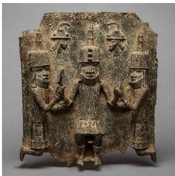
Relief plaque: King with two dignitaries C2897 16 th / 17th century © MARKK