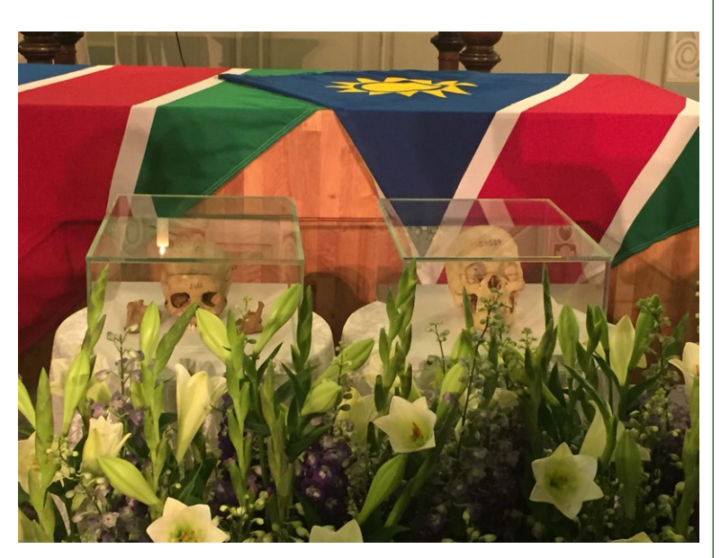
FIG 1 Namibian skulls on display at special vigil, 28 August 2018, Französische Friedrichstadtkirche, Berlin.

Bishop Petra Bosse-Huber of the German Evangelical Churches delivered the first sermon invoking Corinthians, to elaborate on the difficulties of distinguishing between night and day, before reaffirming the church's 2017 official apology for its role in the Genocide, saying missionaries were misguided by "arrogance of their cultural pride." Bishop Ernst from the Council of Namibian Churches delivered a stern sermon outlining the significance of the handover as marking the return of remains that stood as witnesses to genocide and martyrs for the struggle of Namibian independence (Figure 4). The sense of instability conveyed by the presence of the remains carried through the fraught ongoing struggle for an official German apology and