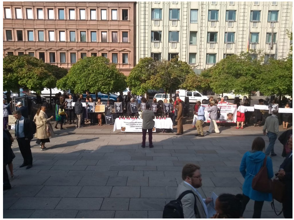
FIG 3 NGO Alliance "No Amnesty on Genocide" protest, 28 August 2018, Französische Friedrichstadtkirche, Berlin.